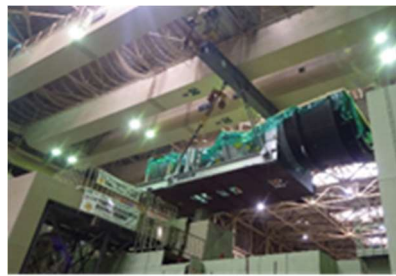
Lifting the upper gas turbine placed inside casing