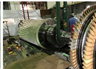
Lifting new gas turbine