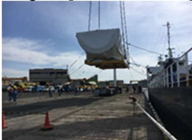
Unloading new gas turbine placed inside casing